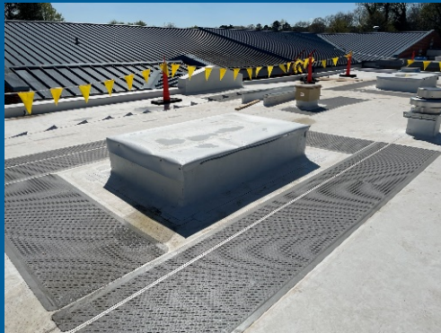
HVAC Rooftop Curbs Set and walkway pads installed at Area D-East roof