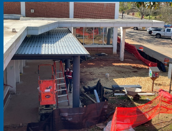
Vestibule Steel Decking Installed