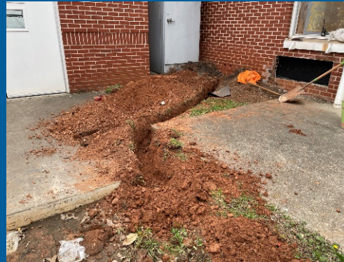
Trenching for LED Monument Sign Ongoing