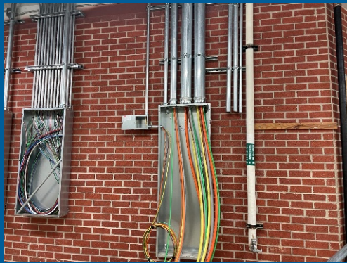
Main electrical feeders for new panels installed