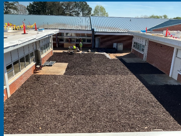
Courtyard Mulch Laid