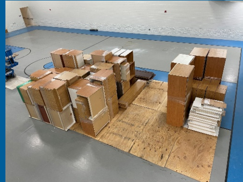
Replacement/New Casework delivered to site