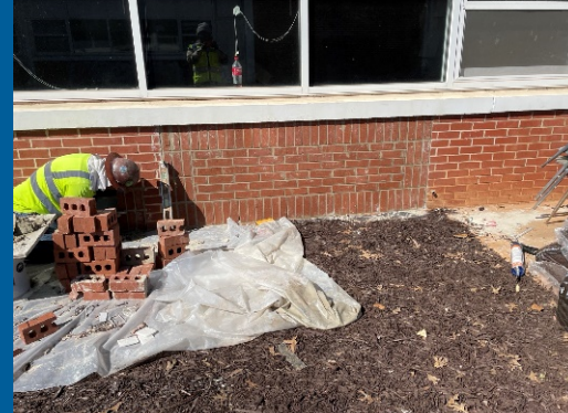
Brick infills completed